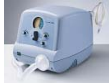
CA-3000, MANUAL MODEL

COMFORTABLE – Provides a deep full breath then a rapid exhale flow, convenient alternative to oral or nasopharygeal suctioning, which is poorly tolerated by most patients